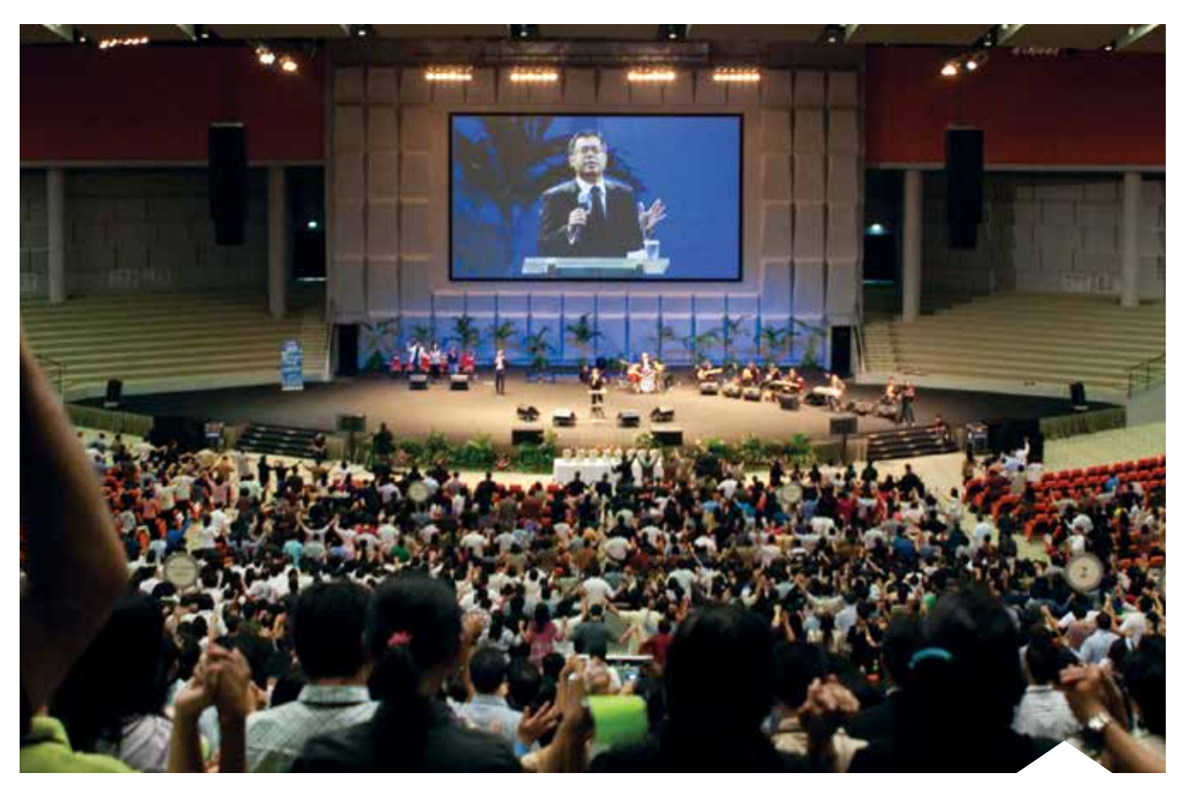
607" Supernova Infinity Screen in Jakarta, Indonesia.