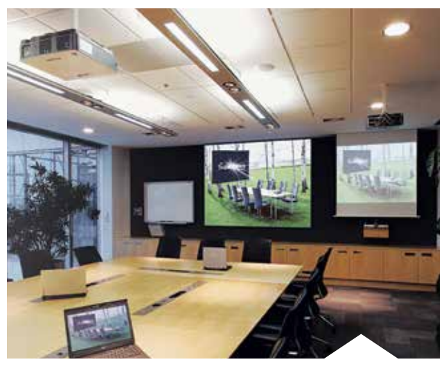
Meeting room with a dnp Supernova Infinity front projection Screen. The screen to the right is a standard white front screen.

Consider the advantages as a presenter: To start with, you can leave the lights on. You are not blinded by the contrast between bright light from the projector and the darkness of the room. You can maintain eye contact with your audience and read their facial expressions. You can even clarify a point by drawing on a whiteboard. What's more, your viewers can take notes without straining their eyes.