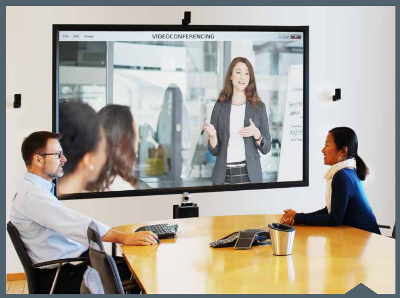
Large-as-life video conferencing on a 110" dnp Supernova One Screen