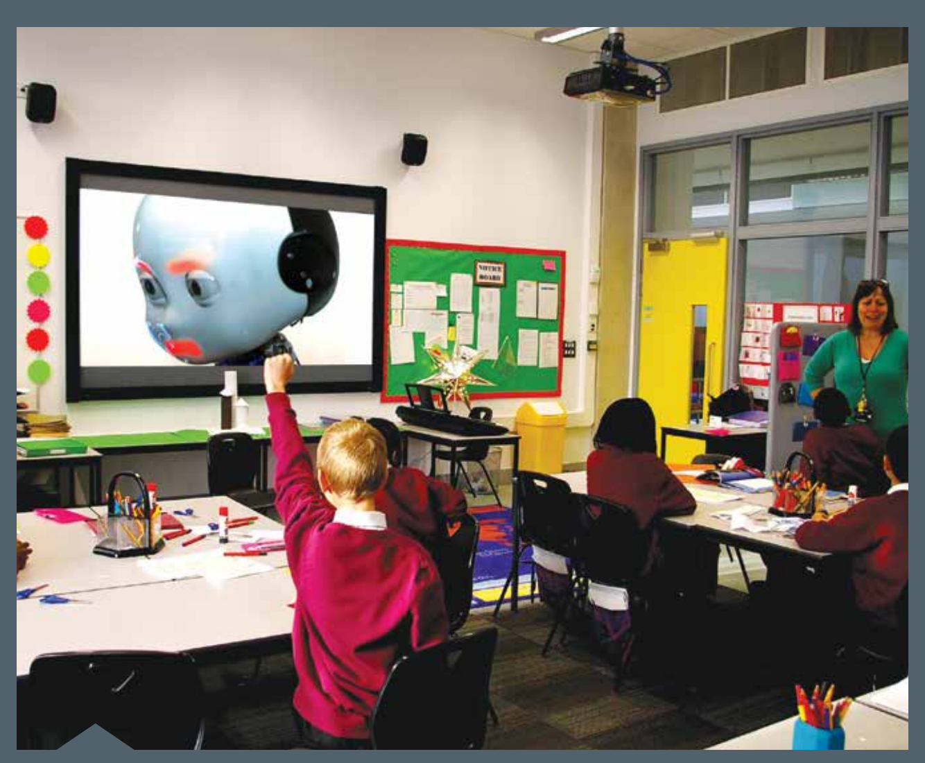
110" dnp Supernova Core optical front projection screens in classroom.

Now, thanks to dnp's revolutionary screen technology, you no longer have to choose. Since dnp screens allow you to project high-contrast images into brightly-lit rooms, you won't tire your viewer's eyes. Your audience will be able to concentrate better and to learn more. After all, that's what they're there for.