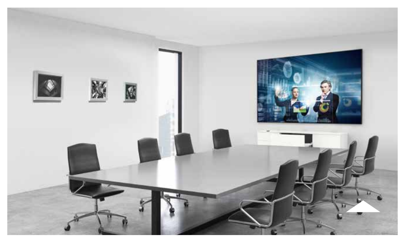
100" dnp LaserPanel Business Classic in conference room.