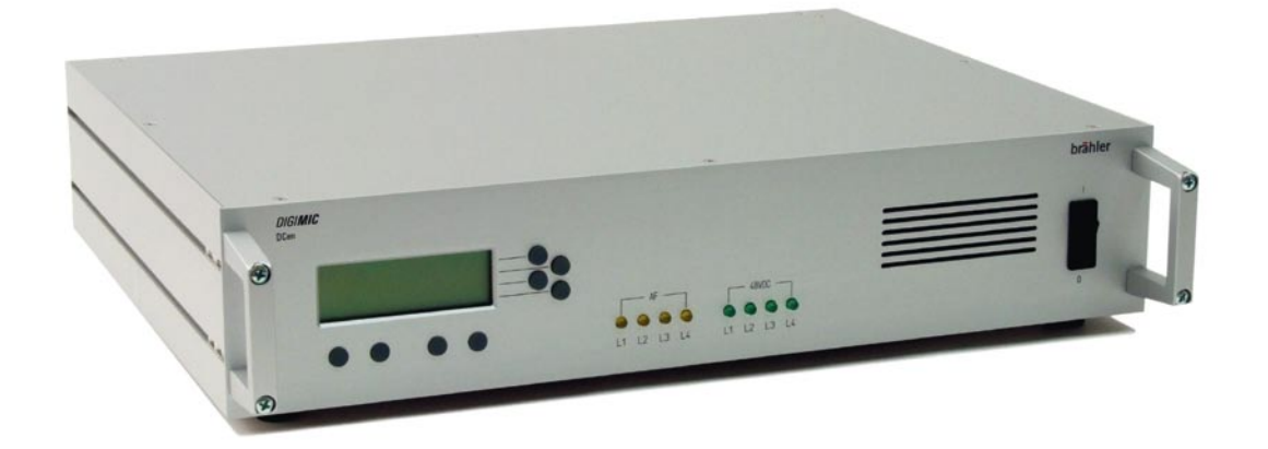
Central Unit DCen 19'