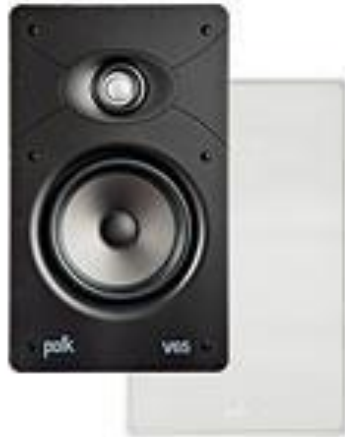
V65 1" aimable tweeter 6.5" Mid/Woofer