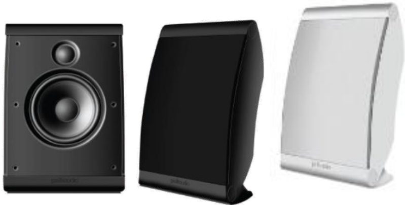
OWM3 1" tweeter 4.5" Mid/Woofer