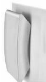
1. Vertical wall mount