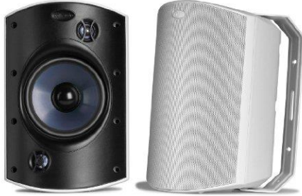
Atrium 8 SDI

6.5" Woofer Switchable for Single-Channel Stereo use