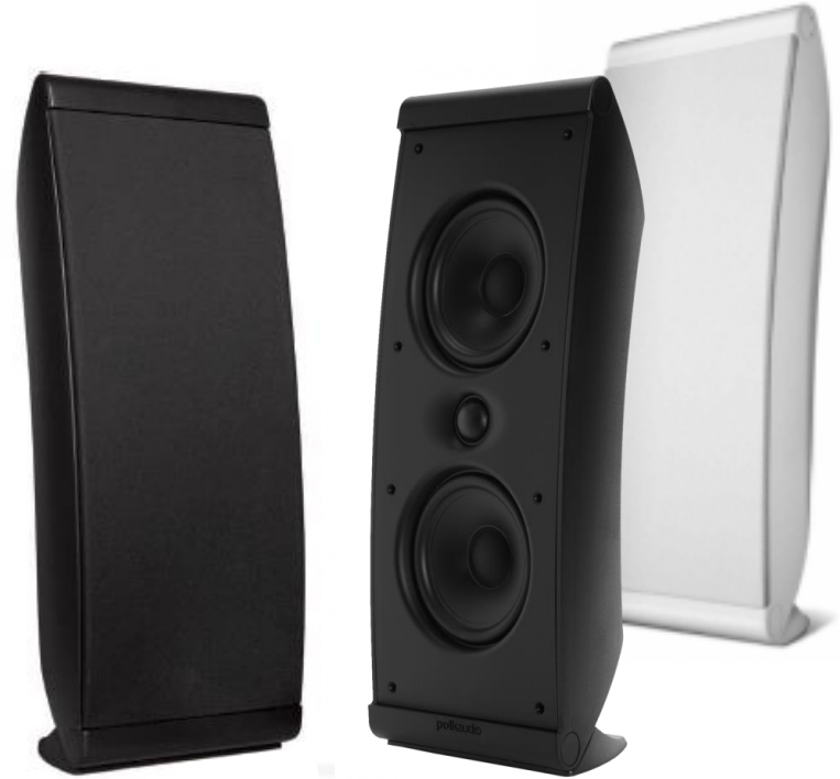
OWM5 1" tweeter 2x 4.5" Mid/Woofers