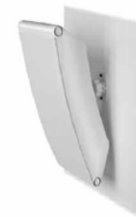
9. 3 rd party wall mount bracket