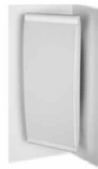
7. Vertical corner wall mount