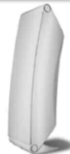
3. Vertical shelf mount