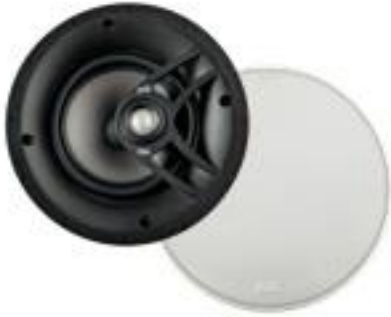
V60 (slim) 0.75" aimable tweeter 6.5" Mid/Woofer