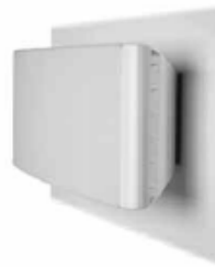
2. Horizontal wall mount