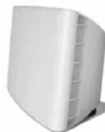
4. Horizontal shelf mount