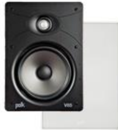
V85 1" aimable tweeter 8" Mid/Woofer