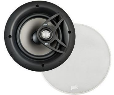
V80 1" aimable tweeter 8" Mid/Woofer