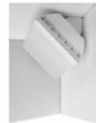
6. Horizontal ceiling mount