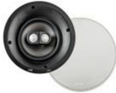
V6S 2x 0.75" aimable tweeters 6.5" Mid/Woofer