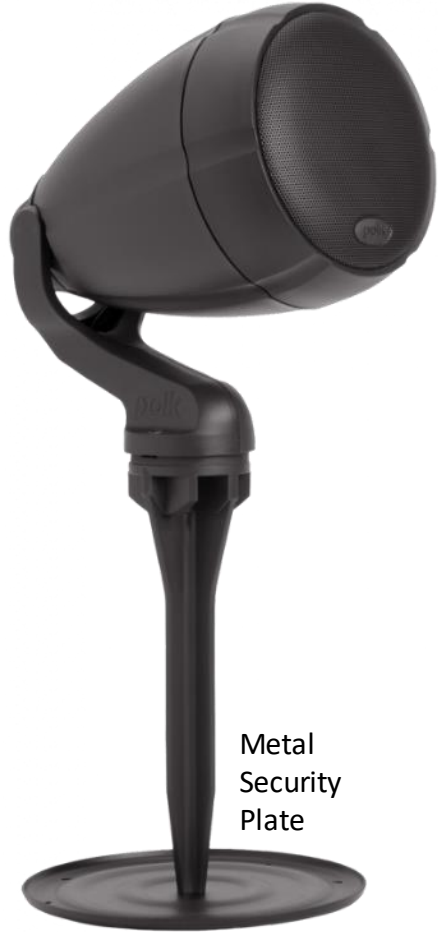
Metal Security Plate

Including all the mounting hardware Color: Chestnut brown, paintable