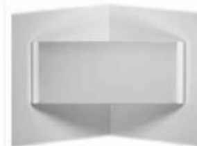
5. Corner wall mount